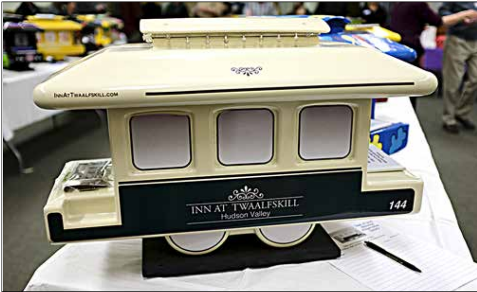
The 'Inn at Twaalfskill' was painted by Jespar Wrangle