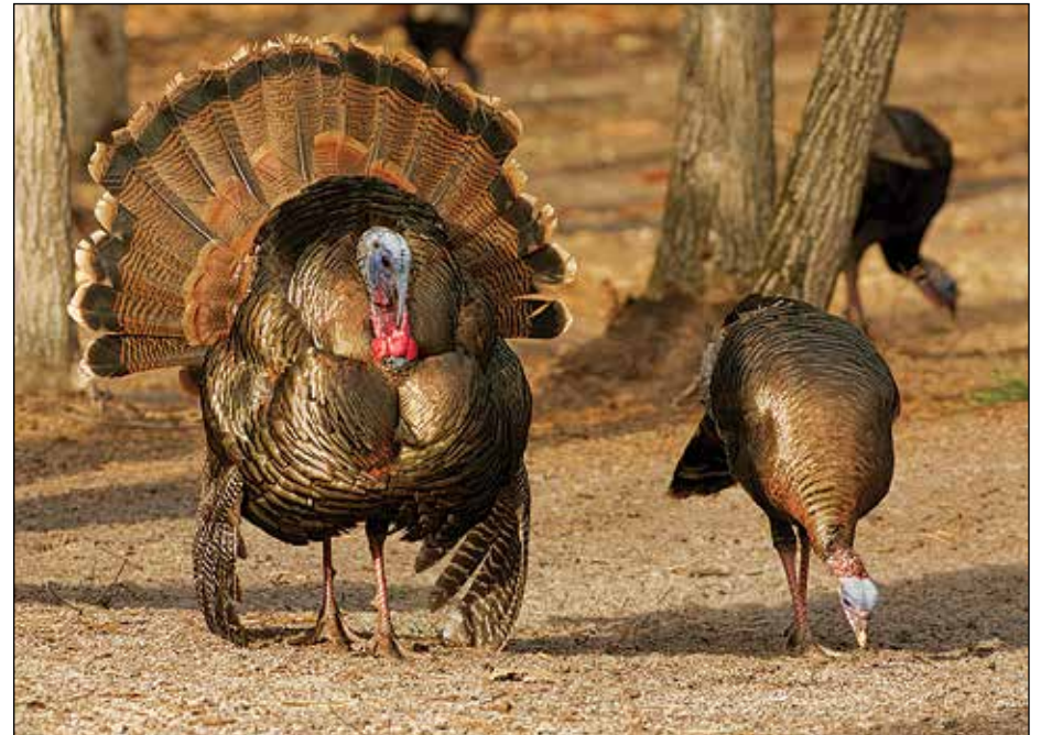
Bring the family for some Thanksgiving fun at the Hudson Highlands Nature Museum's Wildlife Education Center (WEC) for "Turkey Tales".

For more information visit hhnm.org or call (845) 534-5506 x204.