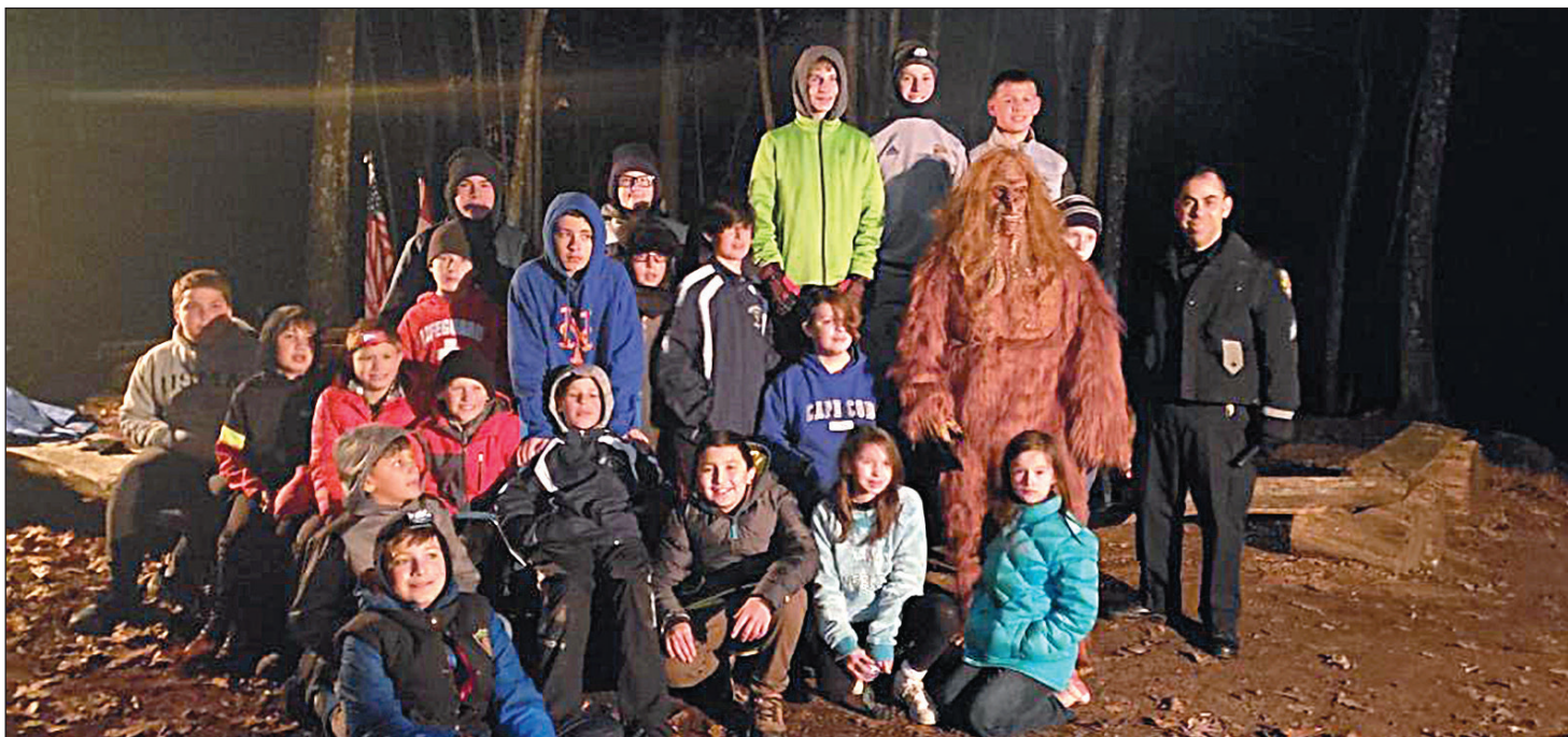
On Saturday, November 9, the Town of Lloyd Police and "friend" visited Boy Scout Troop 70 on their frigid overnight camp out at Berean Park. The officers brought hot chocolate and donuts to the campers as a treat to help them stay warm.

snow and ice from roads in the town maintained by the Town of Lloyd, parking of any motor vehicles is prohibited on all town maintained roads from October 15 – April 15 between the hours of 12 midnight to 7 a.m. except in the Hamlet of Highland where it is 3 a.m. to 7 a.m.