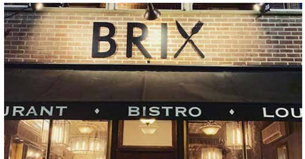
Brix Gastropub in Marlboro.

Brix Gastropub is located at 1 King Street in Marlboro. Hours are: Monday - Friday, 3 p.m. - midnight, Saturday-Sunday 11 a.m. - midnight. Call (845) 236-9981 for reservations.