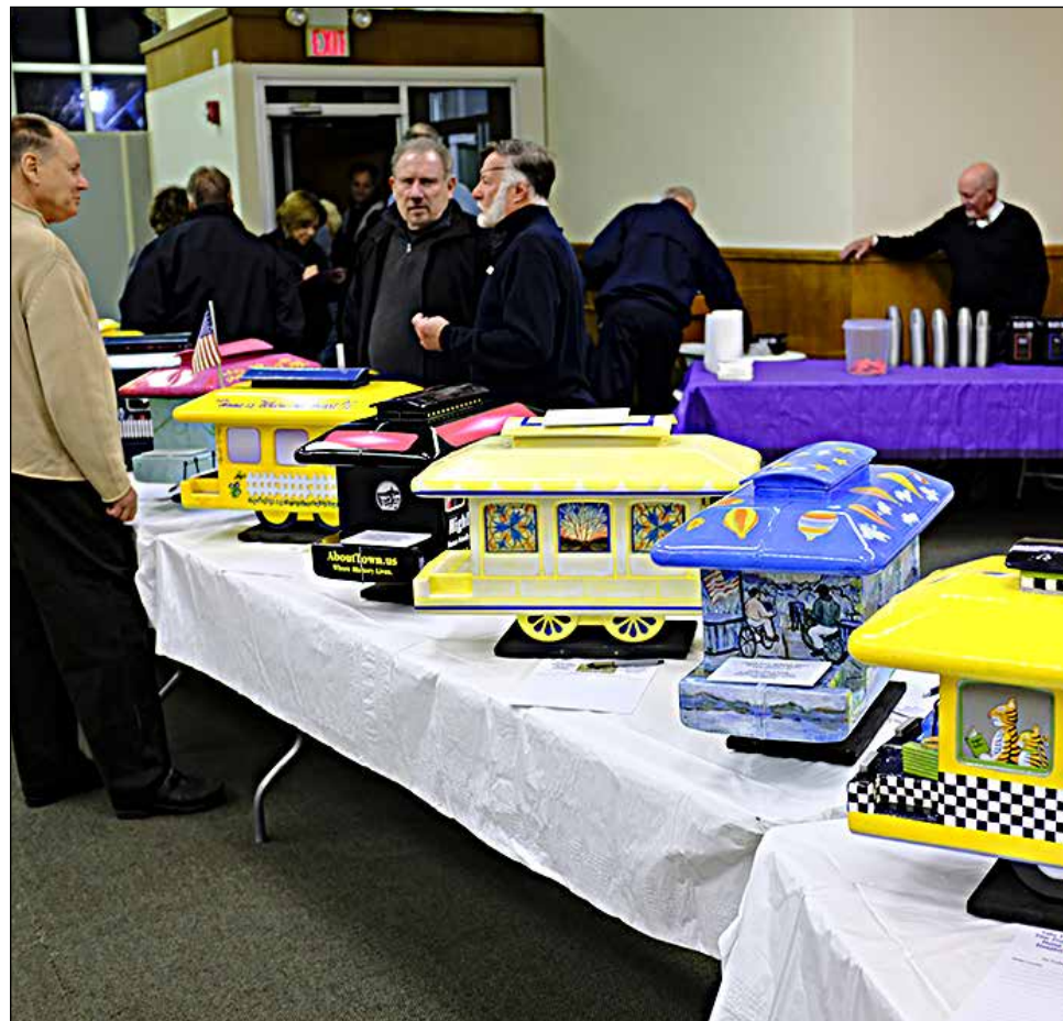
People submitted bids for the trolley of their choice.

"I conceptualized and created both the Firehouse and St. Augustine trolleys and