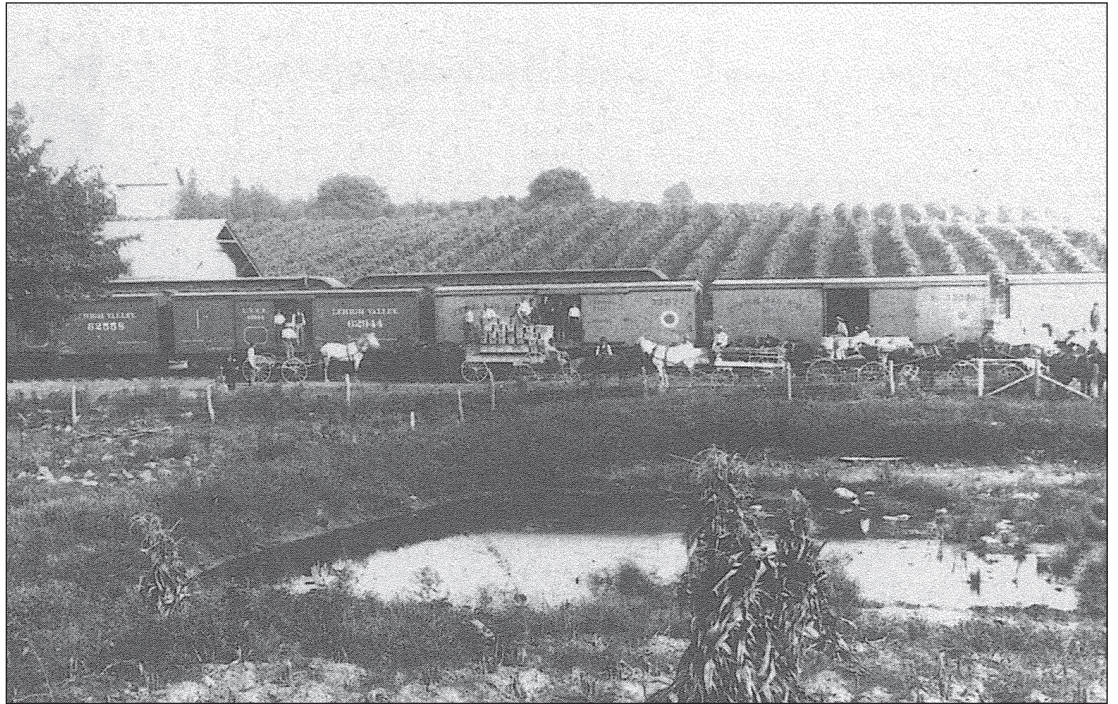
Grapes are being loaded at the Clintonville station, circa 1890. The land is currently part of Apple Greens Golf Course.