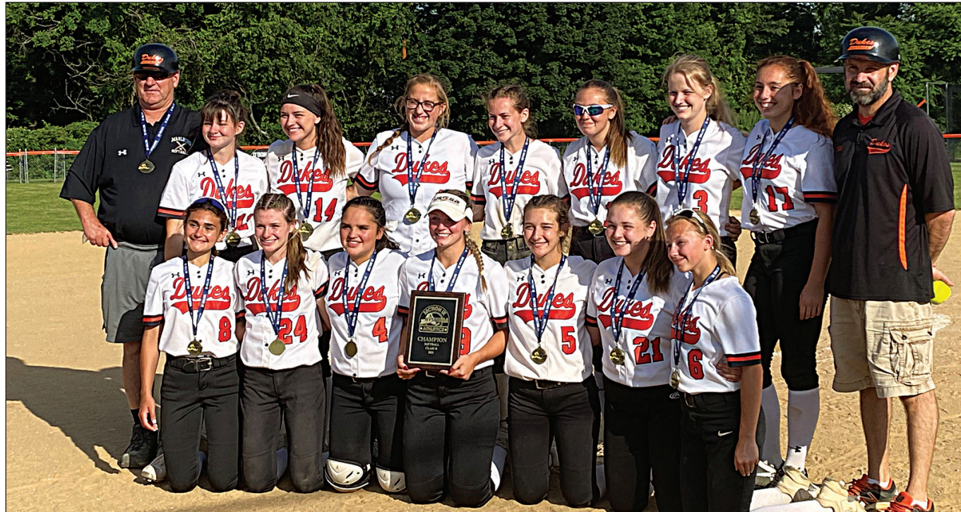
The Marlboro softball team holds up the Section 9 plaque after winning the Section 9 Class B plaque on Friday at Marlboro High School.