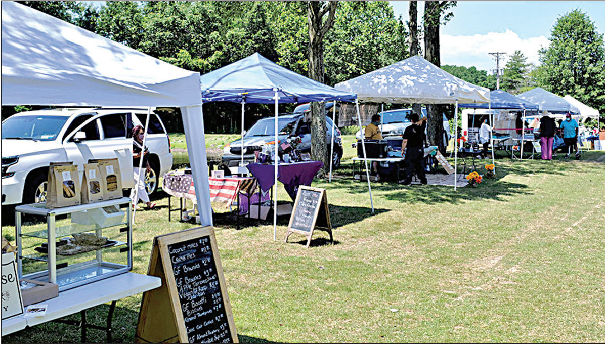
Vendors at the Farmers Market line up at the town park along Route 9W in Milton every Saturday from 9 a.m. to 2 p.m.