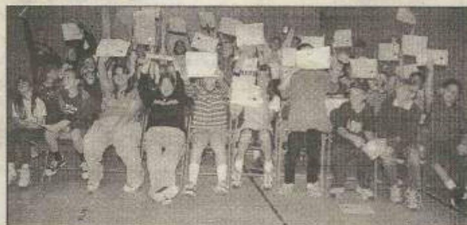
5 th Grade graduates shrieking with delight, waving their certificates.