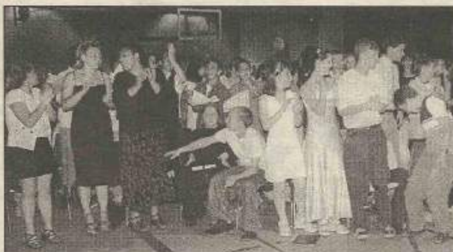
KPMS 8 th graders graduation.