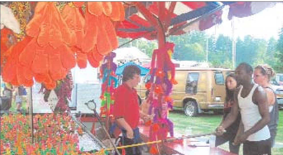
The three-day event has all the staples of a fair, from rides and games to entertainment.