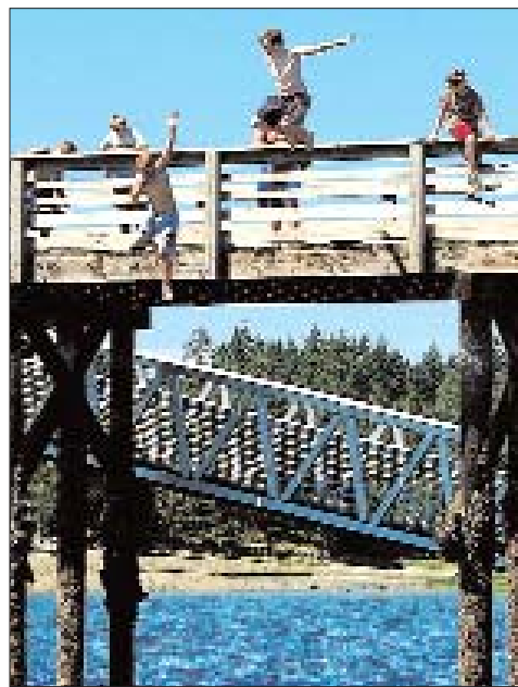
Top, The Joemma Beach State Park on a busy summer day. Parking fees are no longer required at state parks, thanks to new legislation enacted earlier this year cancelling the fees. Left, kids cool off on a hot summer day by jumping into the water off the Allyn dock.

To see more Out & About photos, visit our Website at www.keypennews.com and follow the Photo Gallery link. See more of your neighbors out and about, Key Peninsula scenes and happenings. The online gallery features only Website exclusive photos!