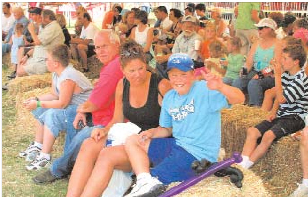
Despite a record heat, crowds try to stay cool while enjoying the entertainment program.