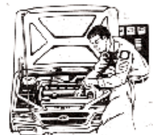
*ASE Certified Techs

Free Exhaust Inspection! Call for Appointment!