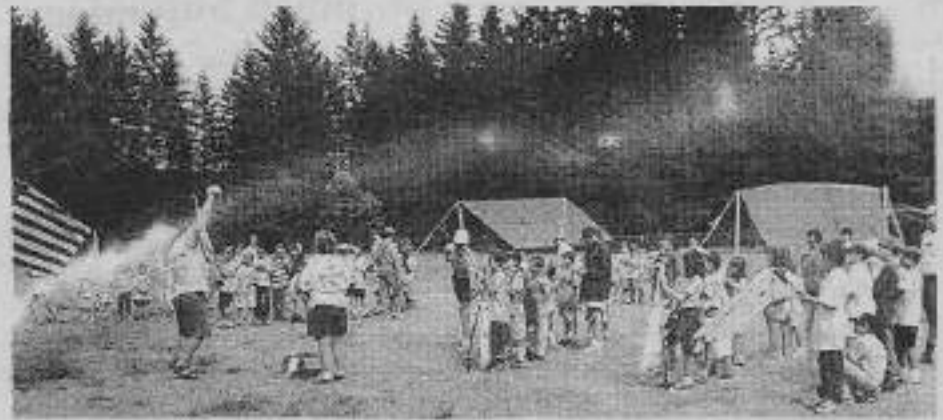
Key Peninsula Cub Scouts of Pack 220, Brownies of Troop 798, both of which are sponsored by the KP Lions Club, and Gig Harbor's Pack 245 Cubs line up with other scout personnel for the presentation of the colors ceremony.

The affair was pronounced an unqualified success by all who participated.