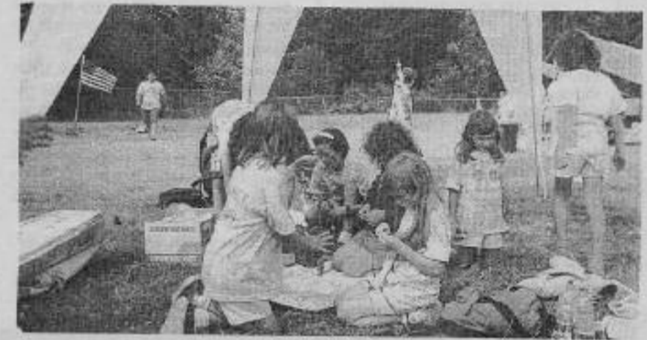
Brownies of Troop 798 work and learn from a camp project.