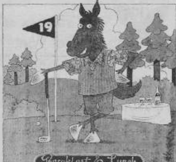
Breakfast & Lunch

DIRECTIONS: Cross Purdy Bridge-Right on 94th Ave. N.W. to Horseshoe Lake Golf Course(across from Horseshoe Lake)