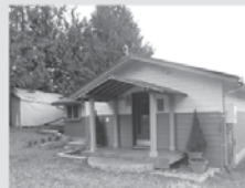
Island Cottage w/Sunsets & Sound Views 2 bdrm-1 ba. Owner Financing Available