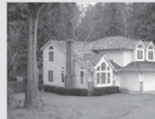
4 bdrm Home in Waterfront Community with Garage/Shop