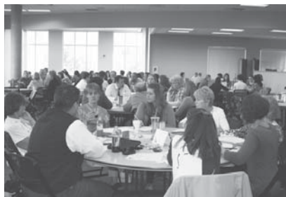
School Improvement Planning teams from all the PSD schools are meeting at Chapel Hill in Gig Harbor during one of the districtwide sessions, which are scheduled four times a year. The teams will meet again for a districtwide session in August, to focus on the 2011-12 school year.

Teams from each of the Peninsula School District's schools are beginning to look at goals for the next year with the help of the ongoing School Improvement Planning (SIP) process. The SIP was implemented by the district several years ago with the purpose of helping leadership teams within each building focus on academic and other objectives.