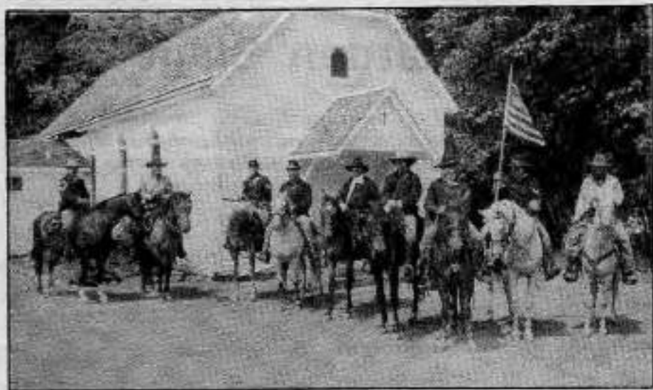
Company L of the 7th U.S. Cavalry Memorial Regiment will be encamped on the Civic Center grounds at Vaughn on August 5, taking part in the Pioneer Days Centennial Celebration.