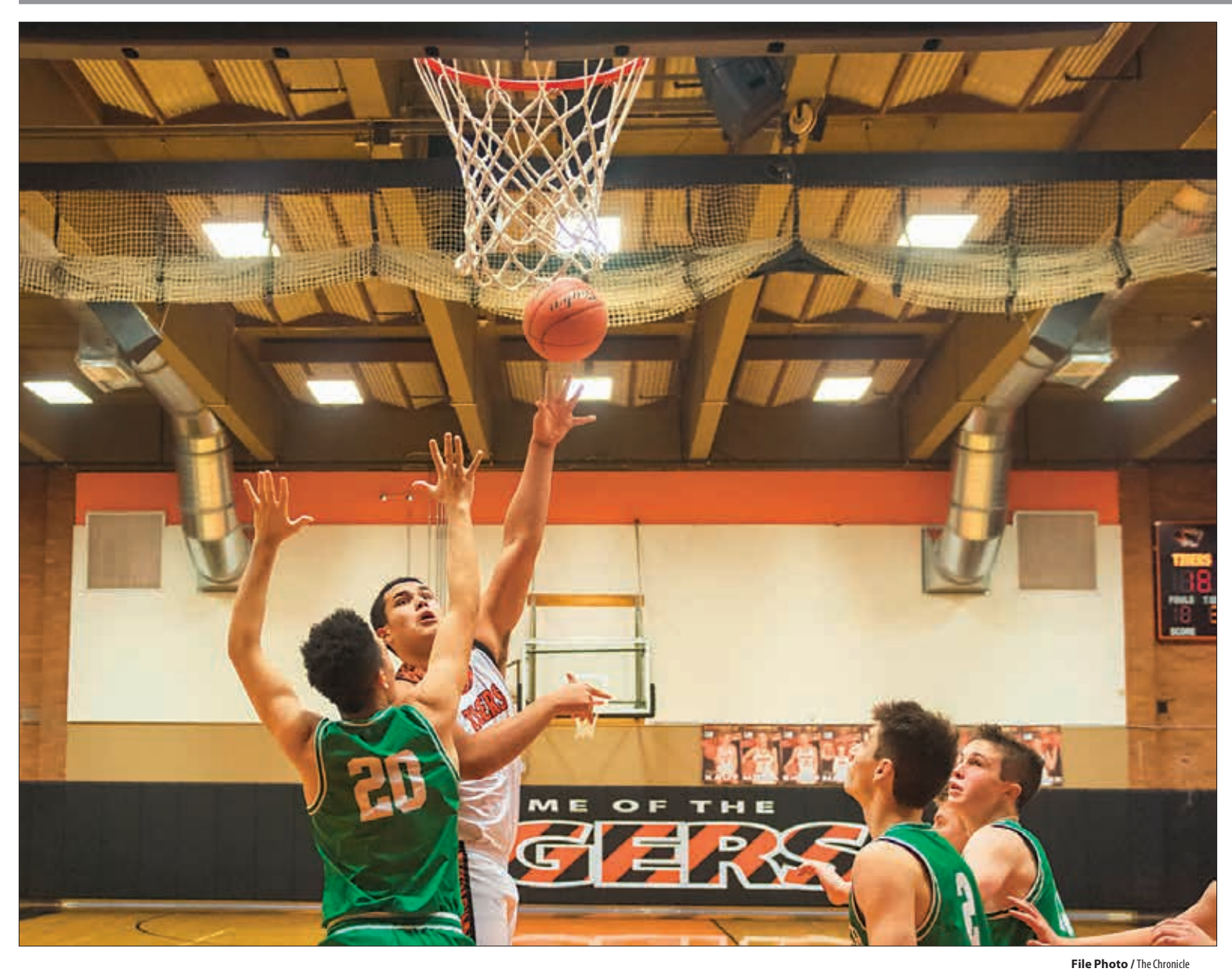
rile Prioto / Tile Cilionicie