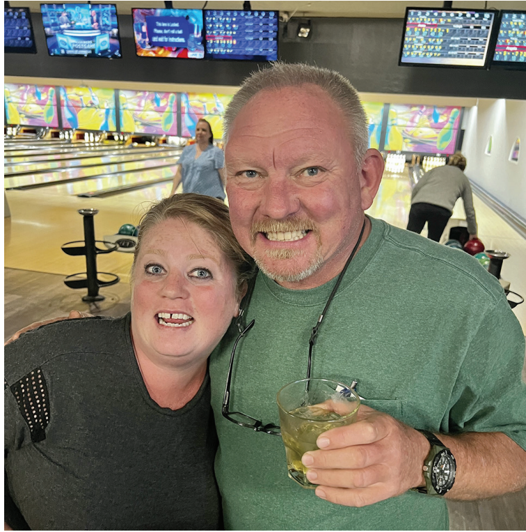
So much fun was had at the first annual OMB Lewis County Chapter Bowling Night at Fairway Lanes!