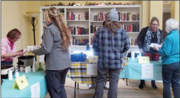
Over a dozen cooks entered Stoney River's first annual Chili Cook-Off, where guests enjoyed tasting and voting for Marshfield's best chili.