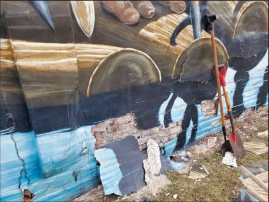
The mural has outlived its lifespan and parts of it are cracking, chipping and crumbling off.

STEVENS POINT – The Rivermen mural has reached the end of its 20-year agreement with property owners and private citizens. The mural on Clark Street was completed in 2004 and is now beginning to deteriorate due to weather. The plaster like surface that mural was painted on has begun to separate from the brick wall. The current owner has expressed interest in re-installing a replacement once the wall beneath the Rivermen mural is repaired. Removal of the mural and repair of the wall will begin immediately. “While it’s sad to have to remove the deteriorated mural that has stood for more than 20 years, one of more than a dozen that have become well known in our community,” said Mayor Mike Wiza. “We now have an opportunity to ensure the view when entering