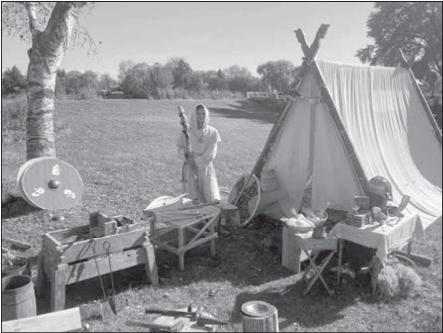
This will be the second year the Viking Market will be at the Iola Mills, an event with Viking demonstrations and venders selling handmade Viking crafts.