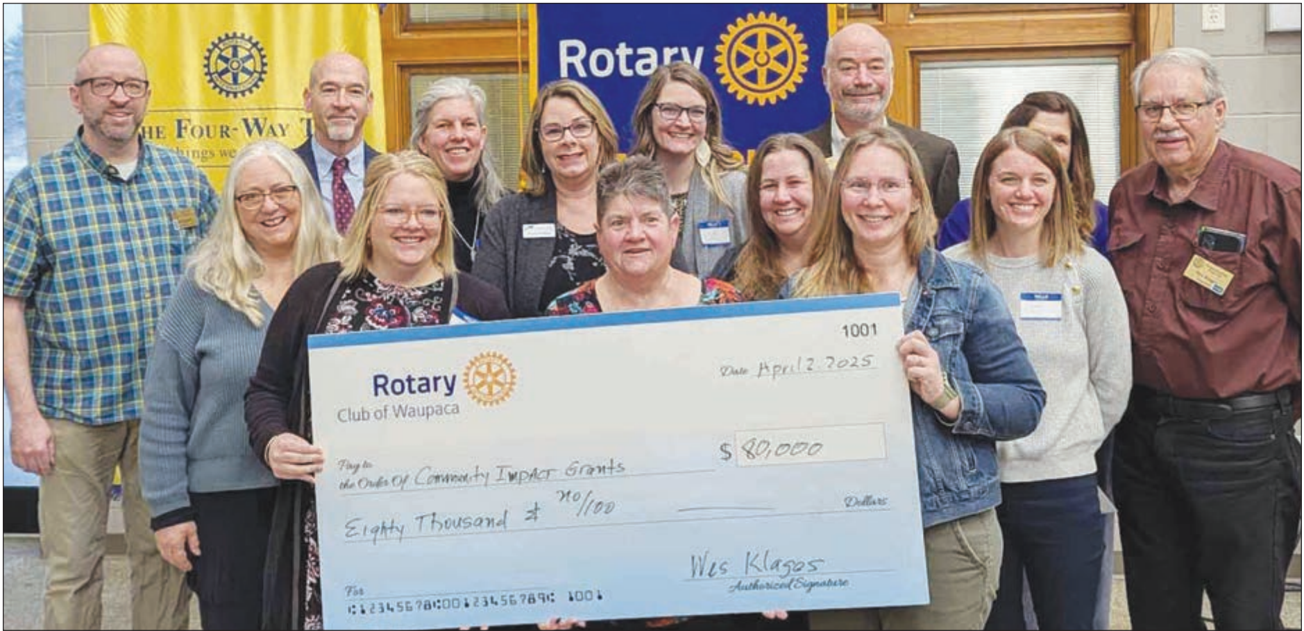
Representatives of the eight organizations receiving Impact Grant funds from The Rotary Club of Waupaca. Submitted Photo

THURSDAY, MAY 1, 2025 | $1.50 | Volume 26 | Issue 45 www.stevenspoint.news Local News | Online Daily | Weekly in Print