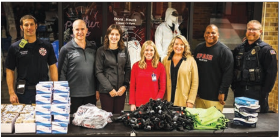
Representatives from Anovia Health, Stevens Point Orthopedics, CVMIC, Land's End, the Stevens Point Police Officers Organization, and Stevens Point Firefighters IAFF Local 484 stand behind life-saving supplies that were packed into Trauma Response Bags for every school in the Stevens Point Area Public School District.

Portage County officials have expressed their goal to