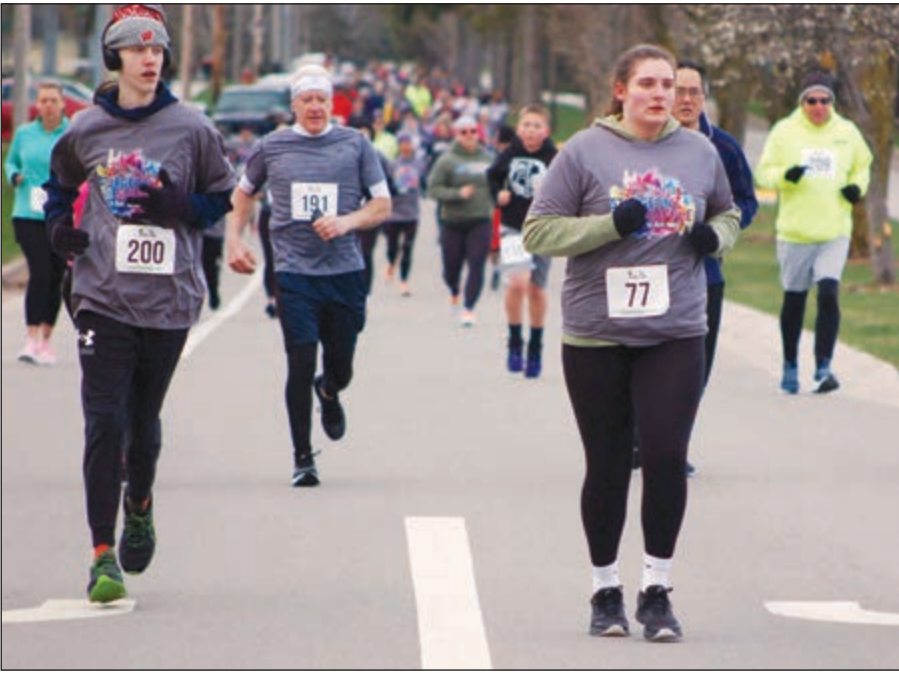
The Sturgeon Shuffle will take place the morning of Saturday, May 3. Motorists should keep an eye out for runners on County Trunk X.

Traffic on County Trunk X and a portion of Werner Allen Road from Washington to Wolf River Avenue will be closed to motorists and detoured during the event. Motorists should be