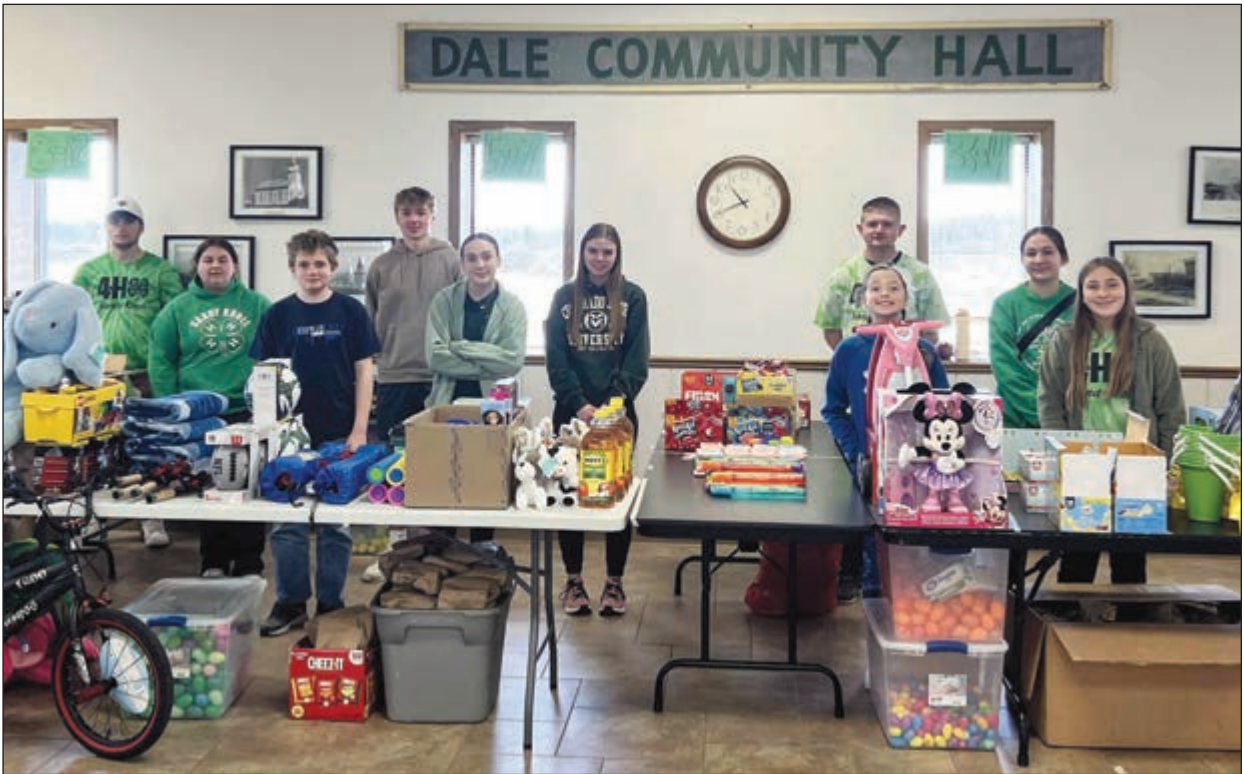
Members of the Sandy Knoll 4-H Club organized an Easter egg hunt at Dale Community Hall.