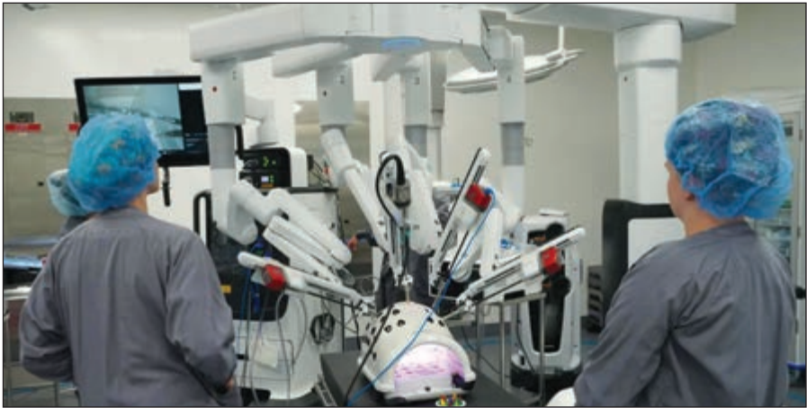
ThedaCare staff train with the da Vinci 5 surgical system, a robotic machine that can perform delicate operations. Surgical procedures with this device are available in Waupaca.