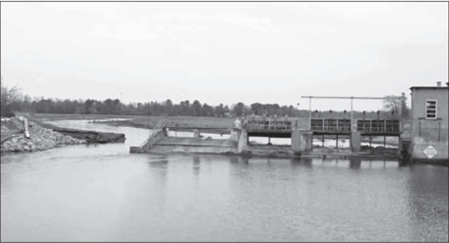
The Manawa Dam quote has been sent to the Joint Finance Committee in Madison as city officials make their voices heard at the committee's local public hearing.