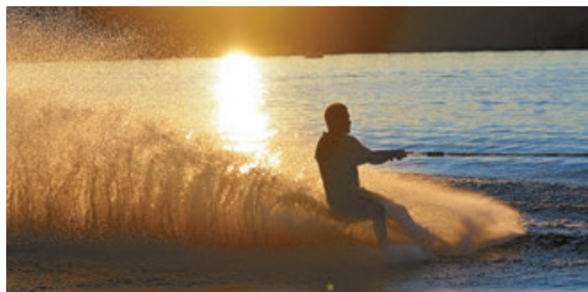
Silhouetted skier on Boom Lake.