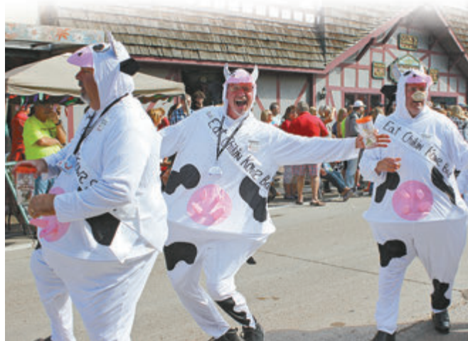
Having a great time at Beef-a-Rama in Minocqua.

• Bearskin Trailhead Park , Minocqua. traillink.com