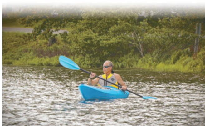
So many lakes to explore in a kayak!