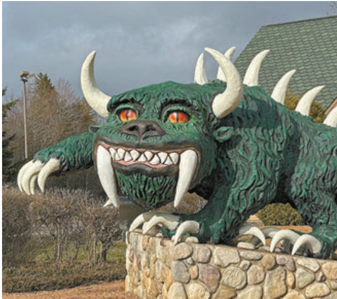
No visit to Rhineland is complete without taking a photo next to the city's famous Hodag statue. Heather Schaefer

Please verify information before heading out to any currently scheduled events, museums or attractions.