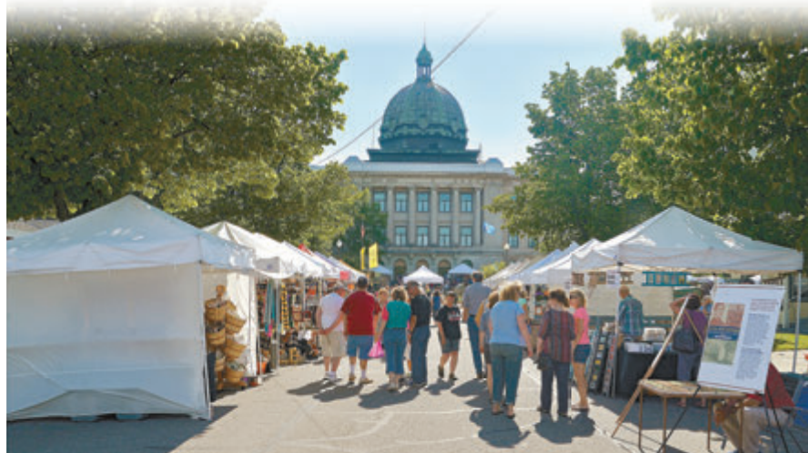
The annual Art Fair on the Courthouse Lawn is a Rhinelander tradition.

14-15 – Spring Classic Musky Tournament: Eagle River Chain of Lakes